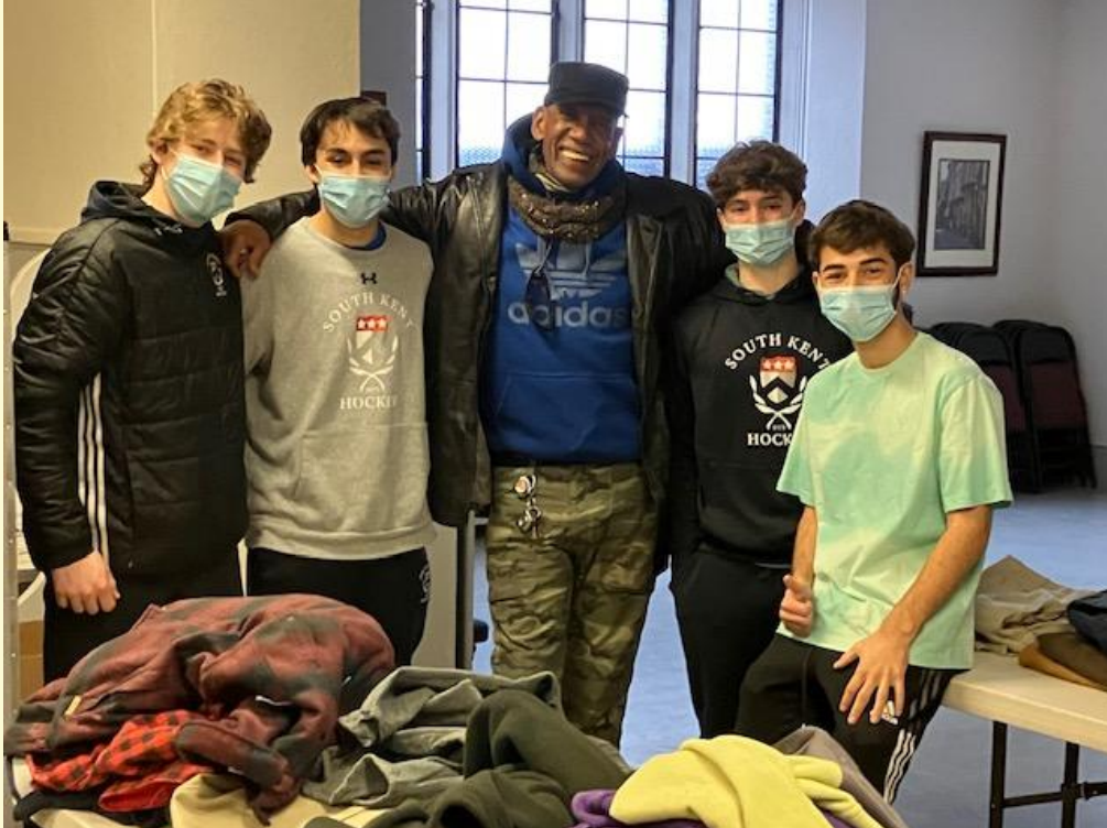
Four South Kent School boys on Sunday, January 28, with a happy Hartford resident at cathedral soup kitchen and clothing boutique.